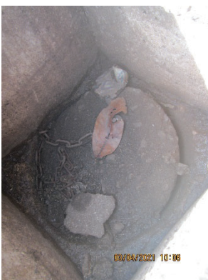
IMG_1440.jpg – Underneath the steel plate covering the restrooms wastewater collection system.