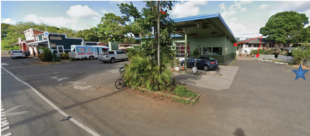
Figure A- Google Maps Street View of the Commerical Property. Red arrows indicate approximate location of the two restrooms and waste clean-out. Island Fresh Cart not depicted in this image, but it's approximate location has been identified by the blue star..

The “Commercial Property”, located at 66-532 Kamehameha Highway in Haleiwa, HI is comprised of a central building (former service station) with the mobile Jennys Shrimp Truck to the north and mobile Island Fresh Takeout cart to the south. Two restrooms are located within the former service station. At the time of the inspection, I observed that the restrooms were open to employees and customers.