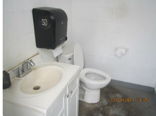
IMG_1437.jpg – Inside the restroom that Jenny’s Shrimp truck pays for access to. Door number 2 (see previous photo).