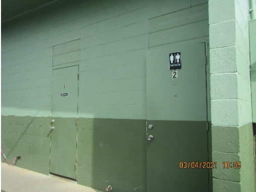
IMG_1436.jpg- Overview of the two restrooms located on the west side of the former service station building.