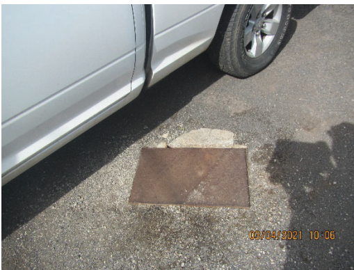
IMG_1438.jpg – Steel plate covering wastewater collection system for the two restrooms.