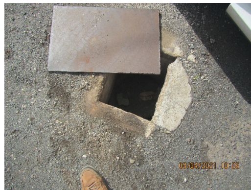
IMG_1439.jpg – Steel plate covering wastewater collection system for the two restrooms.