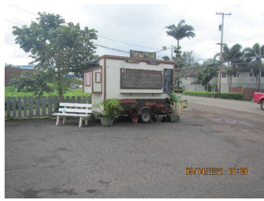
IMG_1441.jpg – Overview of the closed Island Fresh Take-Out cart.