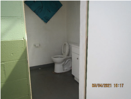
IMG_1442.jpg – Inside of the #1 restroom. (see first photo).

Commerical Property 66-532 Kamehameha Highway Haleiwa, HI 96712 Inspection Date: March 4, 2021